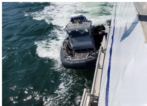
Local Law Enforcement Response Team