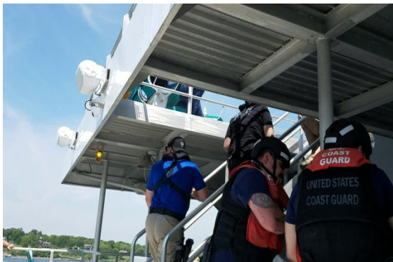
USCG Law Enforcement Response Team