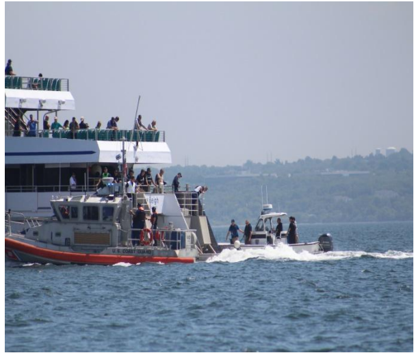
USCG and Law Enforcement responding to the incident