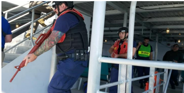
USCG Law Enforces Response Team in action