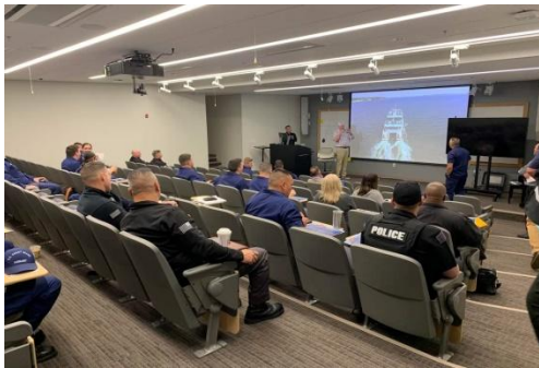
Post Exercise "Hot Wash"